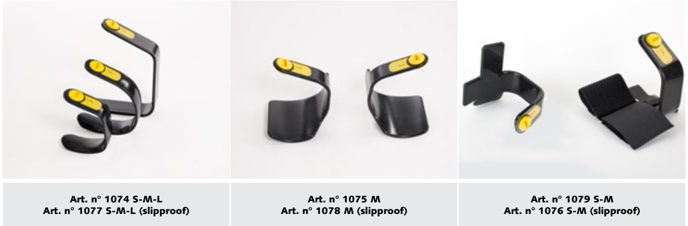
Art. n° 1074 S-M-L Art. n° 1077 S-M-L (slipproof)